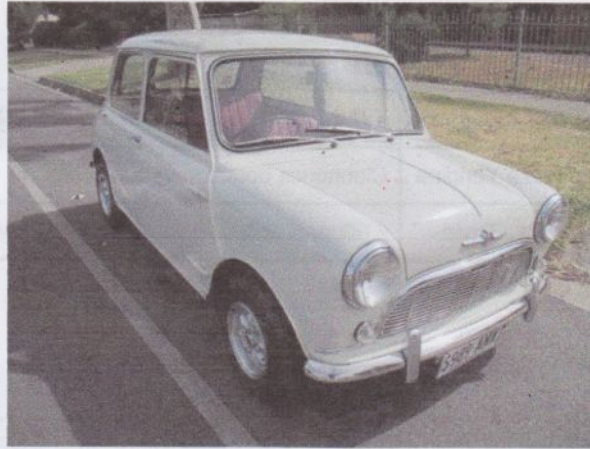
1964 Morris Mini 850