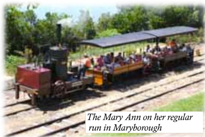
The Mary Ann on her regular run in Maryborough

moving around the park at Maryborough but she was trucked to Gympie. In the special steam weekend, it was the second visit to Gympie.