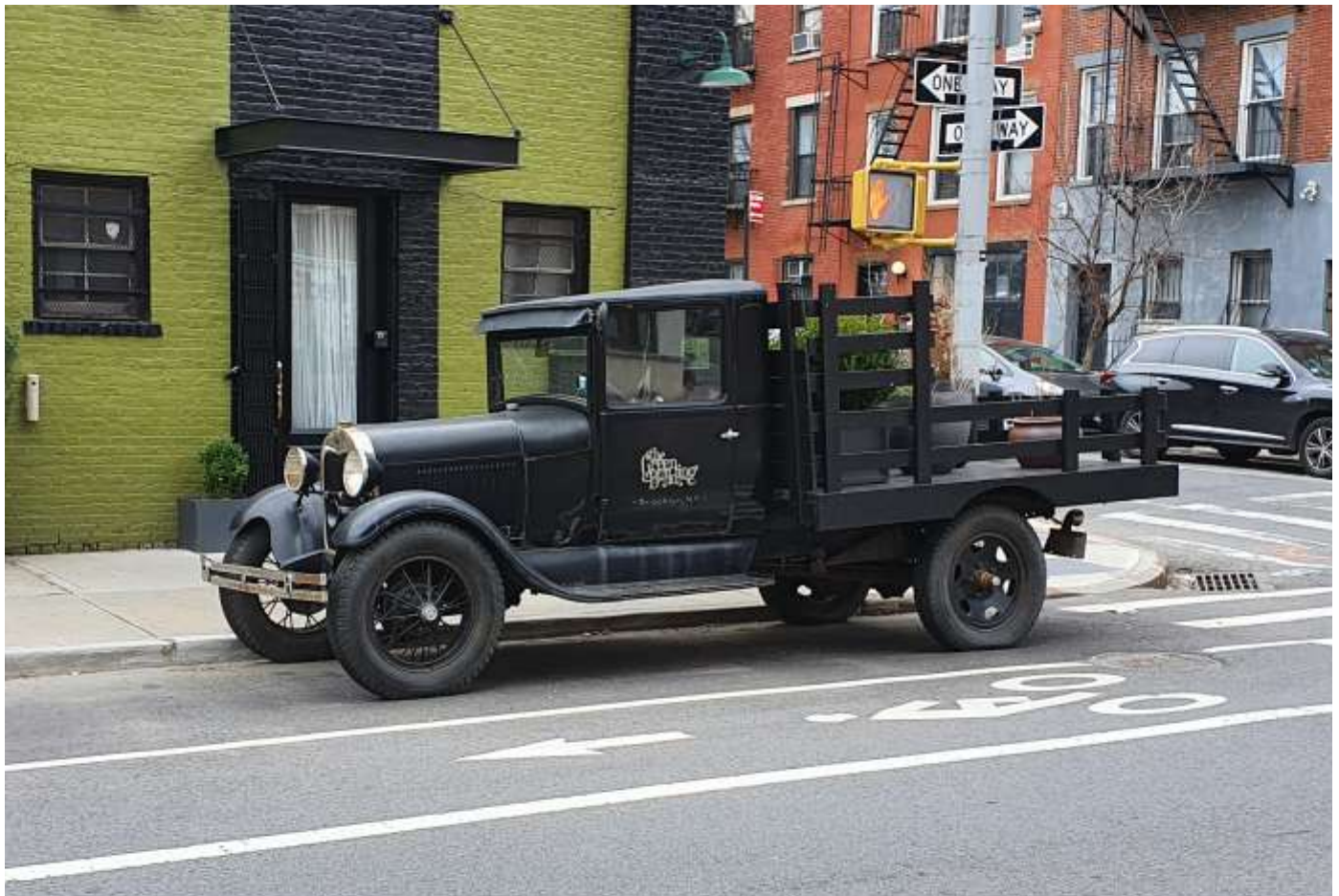
Spotted this old girl in Brooklyn on a recent trip to the USA.