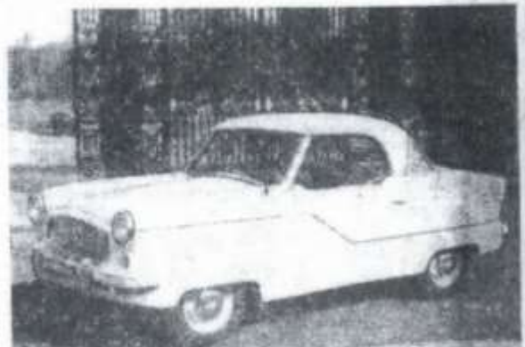
THE SALOON version of the Nash Metropolitan. Austin have made 30,000 of these for Nash. Austin have no hand in merchandising the cars; they are merely manufacturers making them under contract.

The car would be very adaptable to the Holden engine.